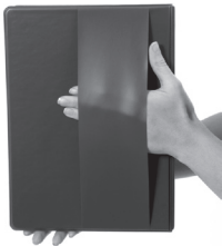
(The back of the ring binders have a strip of vinyl to slip your hand through to steady the binder.)